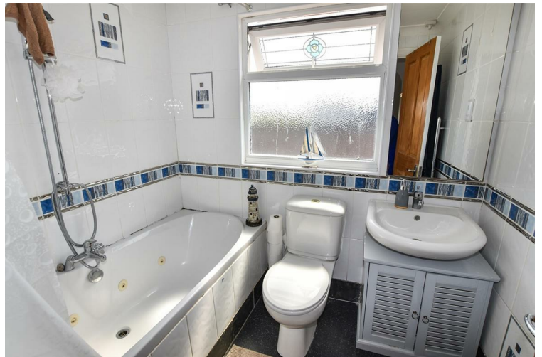
White suite comprising panelled bath with shower over, pedestal wash hand basin with storage cupboard, dual flush W.C fully tiled walls, chrome heated towel rail/radiator. Obscure window to side, skimmed finish ceiling with inset lighting.