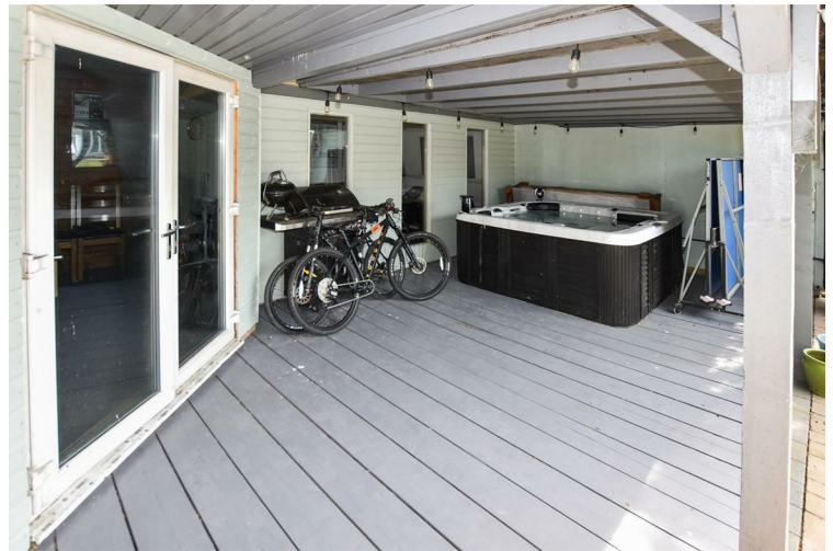
Games Room 27'3 x 14'6 red 9' (8.31m x 4.42m red 2.74m)