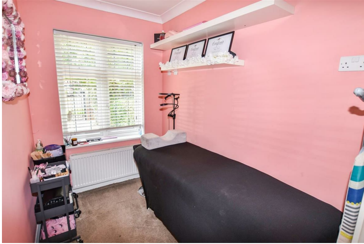
Window to front, fitted wardrobes and shelving, carpet, radiator, coved and skimmed finish ceiling.