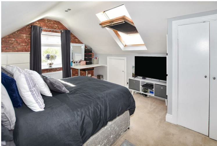
Window to rear and Velux window, 2 eaves cupboards plus built in wardrobe and further storage cupboard, carpet, radiator.