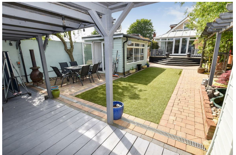
Indian Sand stone patio with block paving to the side leading to