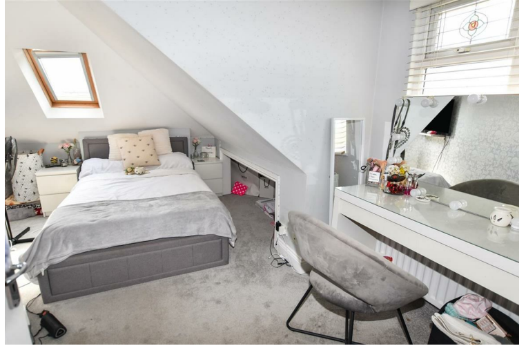
Window to front, Velux window to side, open wardrobe and shelving space in eaves, carpet, skimmed finish ceiling (some restricted head room)